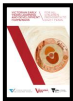
Victorian Early Years Learning and Development Framework

Approved learning framework: A document that outlines practices that educators and co-ordinators must use to support and promote children’s learning. The Early Years Learning Framework (Belonging, Being & Becoming), the Victorian Early Years Learning and Development Framework and My Time, Our Place; Framework for School Age Care in Australia are approved learning frameworks for use in Victoria ( refer to Sources ).