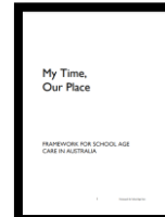
My Time, Our Place; Framework for School Age Care in Australia

Critical reflection: Reflective practices that focus on implications for equity and social justice ( Early Years Learning Framework – refer to Sources ).